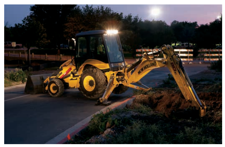
Excellent lighting for night working